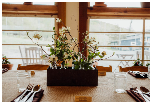
Bud Vases arranged in BHF antique box