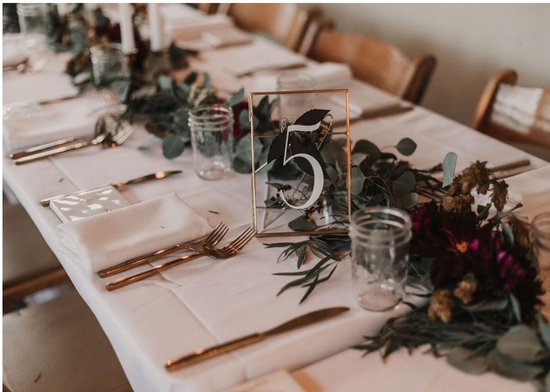
Mix of Eucalyptus, Ruscus, and herb garland runner with tucked flowers