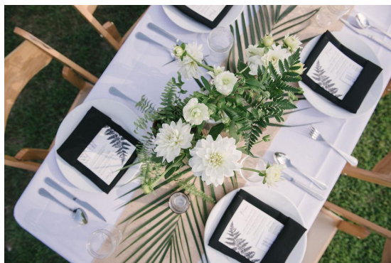
Bud Vases with single layer of greenery