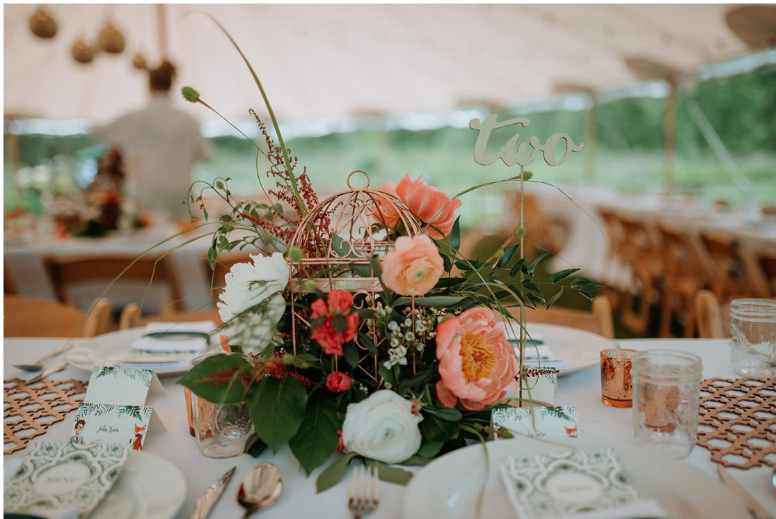
Custom Centerpiece Vessel