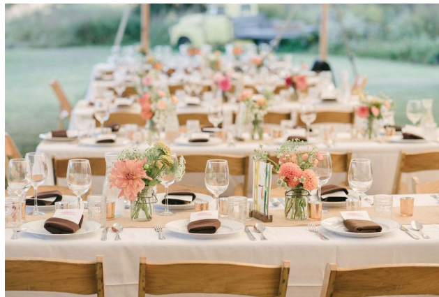
Antique Mason Jar