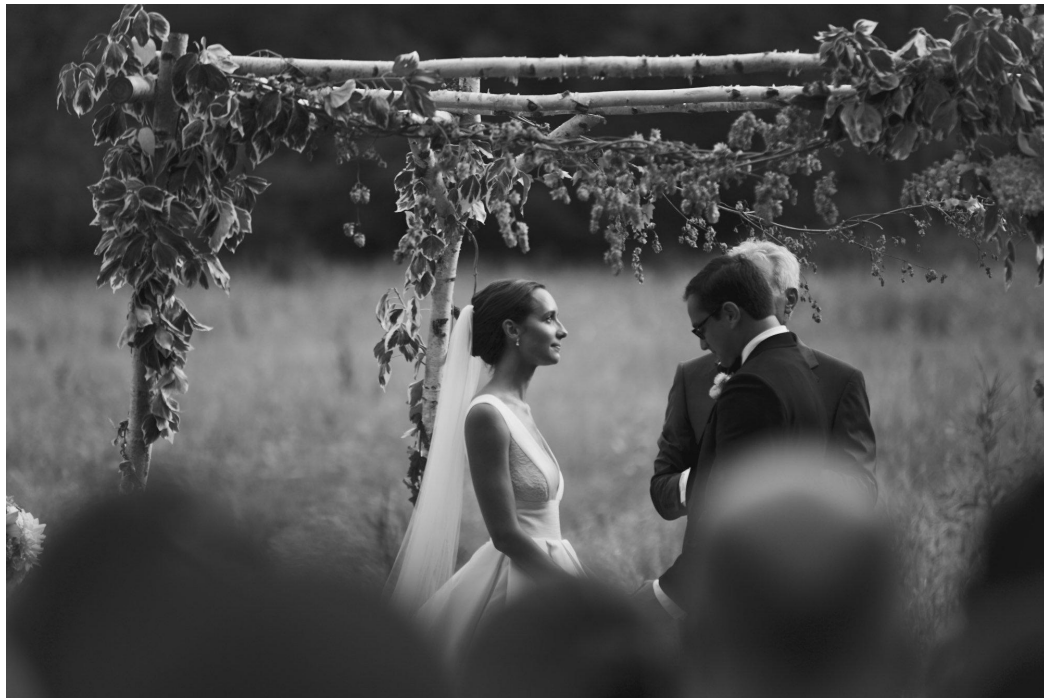
Chuppah with draping seasonal greenery + Flower installation