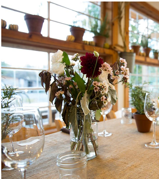
Antique Mason Jar