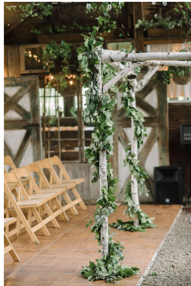
Chuppah with draping seasonal greenery