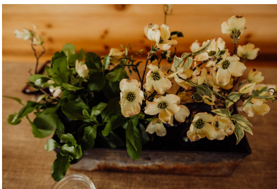
Bud Vases arranged in BHF antique box