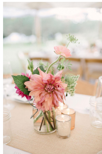
Antique Mason Jar