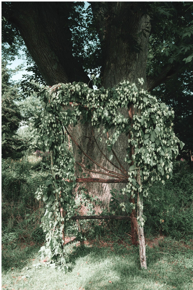
Frame Arbor with Seasonal Greenery + Hop Installation