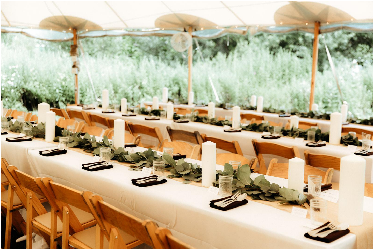
Eucalyptus Garland Runner