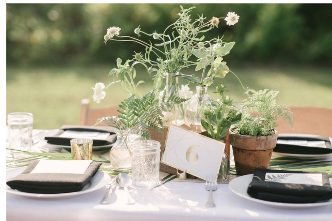
Mix of Bud Vases with BHF potted herbs