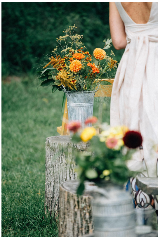
Flower arrangements lining aisle in galvanized buckets