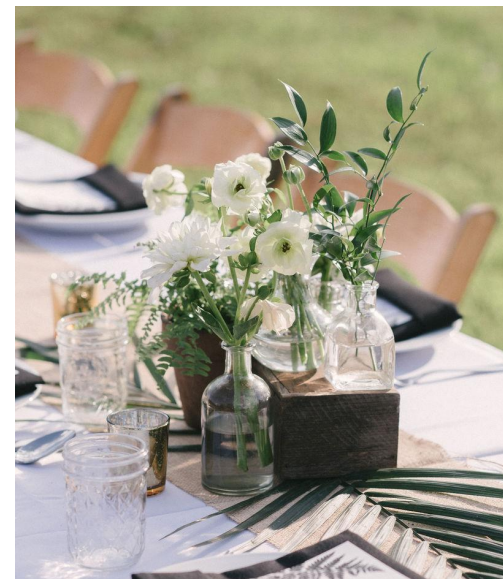
Bud Vases & Potted herbs