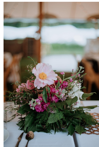
Custom Centerpiece Vessel