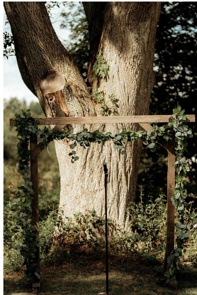
Frame Arbor with Seasonal Greenery